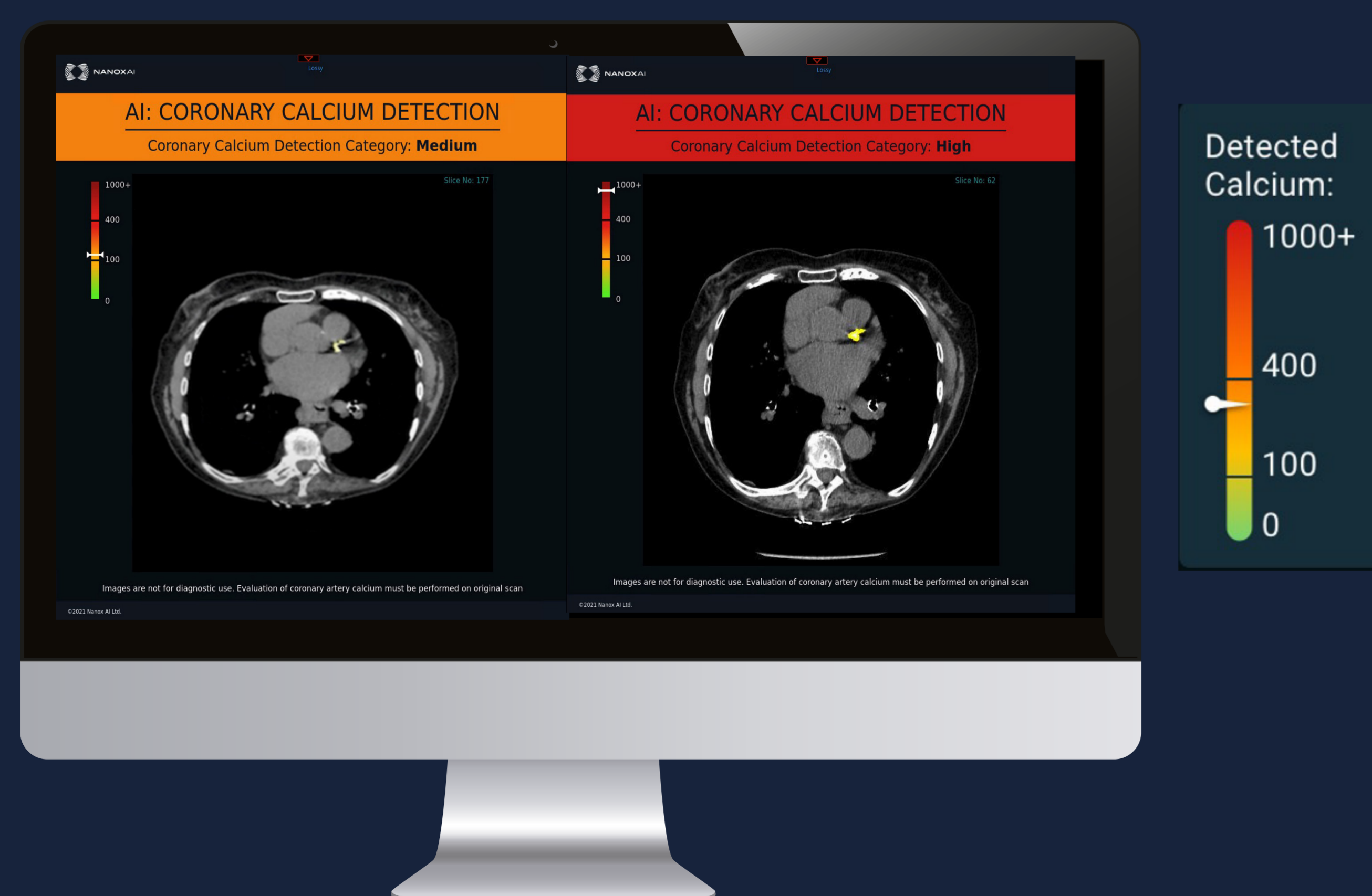
Sample images – HealthCCSng output depicting different coronary calcium levels (each patient is assigned one single level)