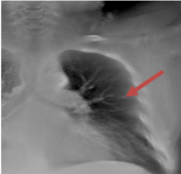
A 3mm nodule is seen in the right upper lobe on DTS only (arrow). The nodule is not seen on the 2D radiographs even retrospectively